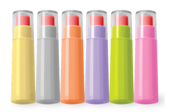
The expanded SurgiLance Lite™ line (three new 21-gauge device on right)