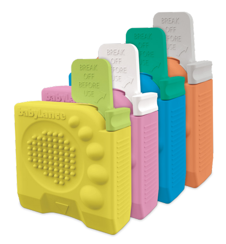
babyLance™ safety heelsticks

The acquisition validates the value of MediPurpose's rigorous design and development processes as well as the success of our sales and marketing efforts in introducing babyLance to the neonatal medical device market.