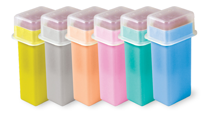
The flagship SurgiLance™ safety lancets

The safety lancet is now a commodity product in many countries. To compete in this mature market, we have to lower our operating margins especially as we try to penetrate new markets in Europe and Latin America. We are also working with our contract manufacturers to manage costs without sacrificing quality. I am very pleased to report that, for the last ten years, we have met our target of less than one complaint per three million safety lancets sold.