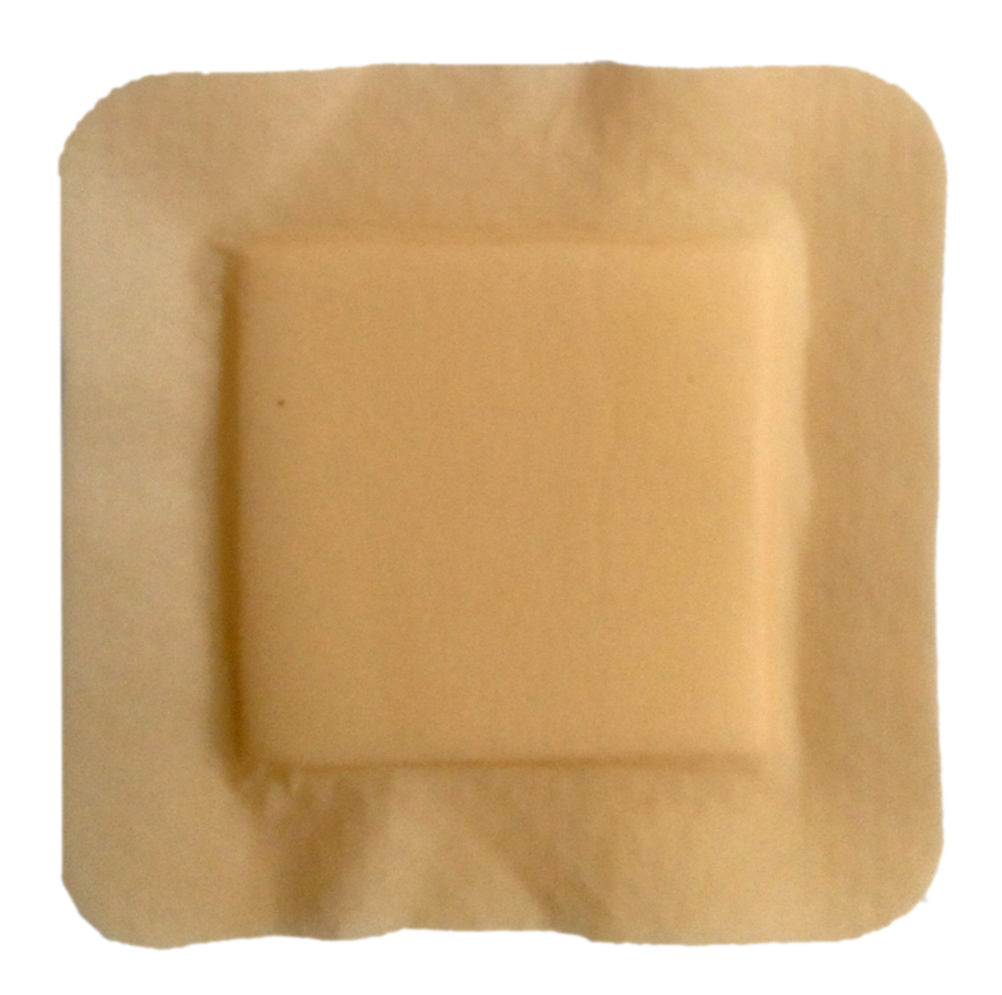
An example of an advanced wound care dressing

Our MediPlus™ Advanced Wound Care products offer our customers a high-quality, cost-effective and comprehensive portfolio of advanced wound care dressings including thin films, hydrocolloids, foams, alginates as well as a range of antimicrobial silver foam and silicone foam products.